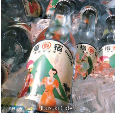
Kagoshima prefecture Ibusuki City