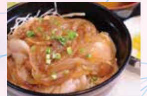
Kurobuta don fried Berkshire pork on rice

● For reservations and further information please contact Ibusuki Municipal Restaurant Tosenkyo Flowing "Somen" Noodle Tel : 0993-32-2143