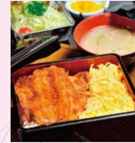
Masu-ju broiled trout on rice with special sauce in a lunch box