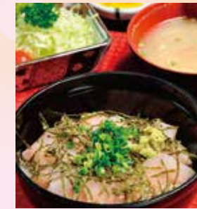
Nijimasu don (sliced raw rainbow trout on rice)

We offer winter special hot menu from November. Please enjoy our trout dishes : Nijimasu-don, Masu-ju, Masu-kamameshi. You will get 100 yen discount when you order something from the menu with somen noodles. Please enjoy the meal that warms up both your body and mind.