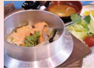
Masu-kamameshi trout on rice cooked in a metal pot