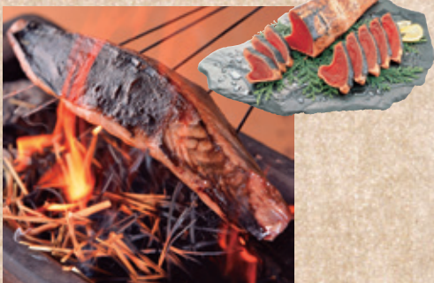
Katsuo-no-tataki (seared bonito fillet)

Distilling of Imo Shochu liquor from sweet-potato is flourishing in Minami-Satsuma region. There are six Imo Shochu distillers in Ibusuki. Each distiller continues to produce good Shochu using their own recipes and traditional skills.