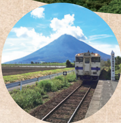
Nishi-Oyama Station, which is the southern-most train station of Japan Railways.

You can walk across to the island when the conditions are satisfied. You can refer to the sandbar calendar at the website Ibusuki Tourism Net for the details of the time during which the Chiririn Road appears.