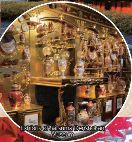
Exhibits of Satsuma Denshokan Museum

Why don't you have an experience of varieties of local history and culture including Satsuma's traditional art/crafts and Ibusuki's folklore traditions inherited for generations?