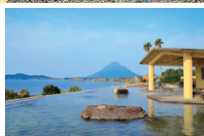
Japanese-style open-air bath "Tamatebako Onsen"

The Very Best hot spring in Japan on popular review site!