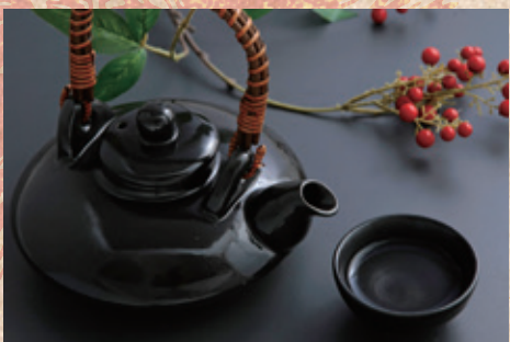
Imo Shochu (local sweet-potato liquor) of Southern Satsuma

Wonderful dishes are creatively cooked to serve a variety of tastes using an abundance of seasonal fresh local ingredients and utilizing the specific tastes of ingredients. How about to enjoy delicious foods of southern Japan?