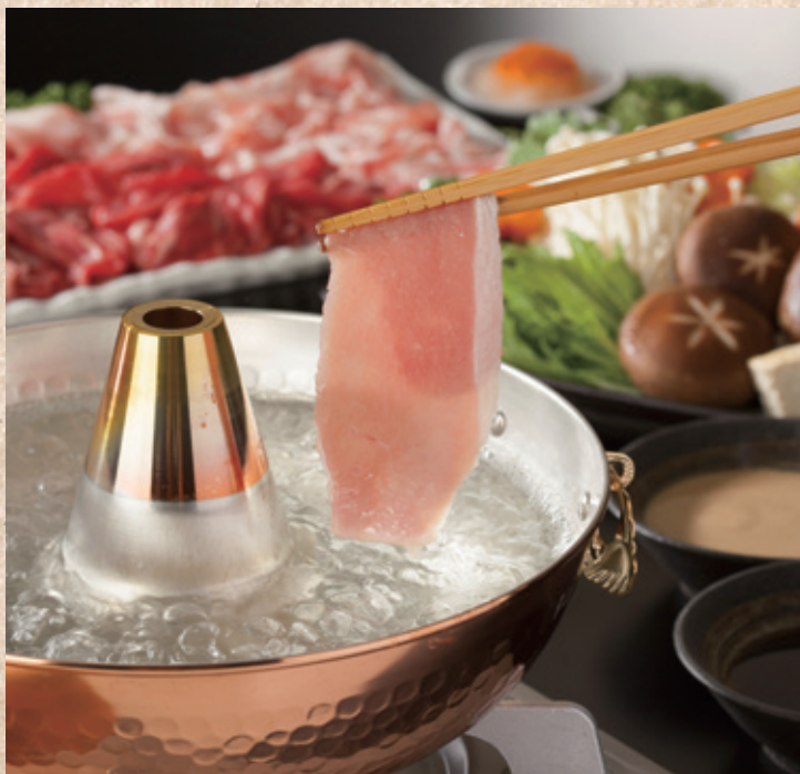
Dishes of Kurobuta (Berkshire Pork)

Healthy food of bonito aromatically seared, with rich nutrients.