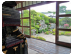
Chiran Samurai Residence

Samurai Residence Garden in Chiran, with a scenic backdrop to the Mount Hahagatake with its graceful scenery, where you can enjoy beautiful townscape spread at the foot of the Mount. This district is also called "Little Kyoto of Satsuma".